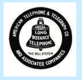
the public image of capitalism during the Gilded Age