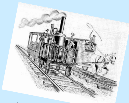
railroads & the rise of corporate management