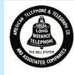
the public image of capitalism during the Gilded Age