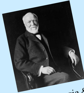
Andrew Carnegie & the creation of U. S. Steel