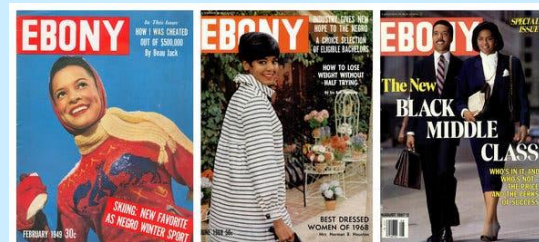
the entrepreneurial challenges & successes of women & people of color